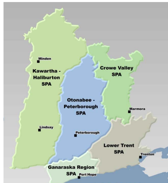
The five Source Protection Areas that make up the Trent Conservation Coalition Source Protection Region

Drinking water systems in the Trent Conservation Coalition Source Protection Region include municipal systems of various sizes that draw raw water from both groundwater and surface water sources. Municipal residential drinking water systems are owned and/or operated by municipalities and serve residential developments. Small municipal residential systems serve fewer than 101 private residences, and large municipal residential systems serve more than 100 private residences.