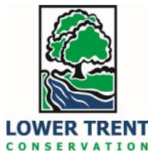
Lower Trent Region Conservation Authority